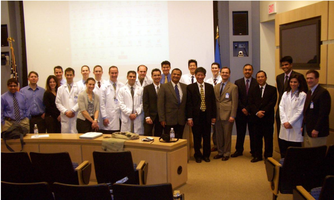
The Tufts Faculty

After a quick lunch, we went to downtown Boston for a quick walk-about town taking in the Heritage trail encompassing the historical monuments of Boston, the wharves and shopping downtown.