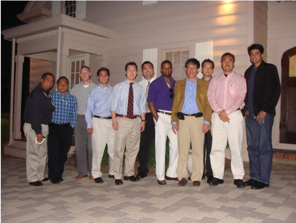
Dinner with the UMDNJ Chief Residents

That evening, some of the chief residents from UMDNJ took us out to dinner at an Italian restaurant where we chatted about resident training, fellowship training and life as an orthopaedic surgeon in New Jersey.